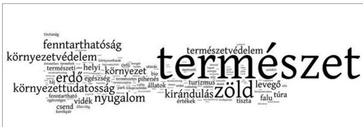
Figure 2.: Free association field of ecotourism in the mind of tourists (ed.: www.wordle.net program) (Translation of the 15 most often mentioned words in connection with ecotourism: természet=nature, zöld=green, erdő=forest, fenntarthatóság=sustainability, környezetvédelem=environmental protection, környezettudatosság=environmental - consciousness, nyugalom=peace, kirándulás=hiking, természetvédelem=nature protection, levegő=air, túra=tour, környezet=environment, vidék=countryside, falu=village, pihenés=resting, állatok=animals)

Within the framework of free association and open ended questions the survey examined the first five expressions that come to tourists’ mind about ecotourism. As it can be seen in Figure 2. most respondents connected the words ‘nature’, ‘green’, ‘forest’ and the expressions ‘environmental