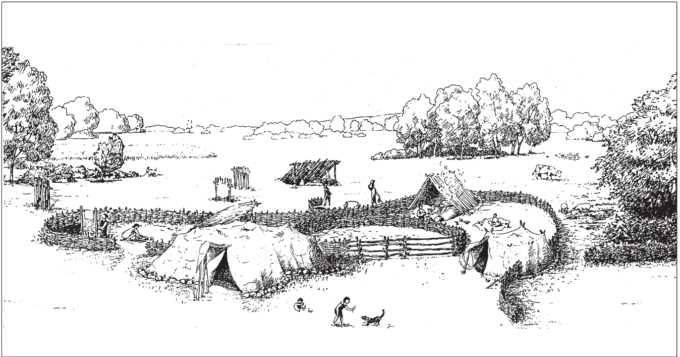
Sl. 1 Zadubravljje: središnji dio naselja – stambene zemunice 6 i 10 s ograđenim dvorištima i radna zemunica 9 s lončarskim i krušnim pećima (rekonstrukcija K. Minichreiter, crtež M. Gregl)