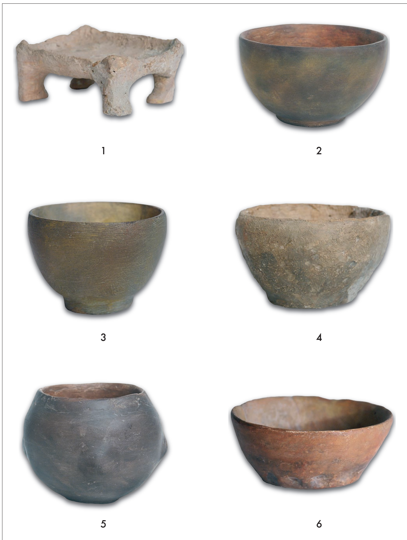
Sl. 3 Zadubravlje, žrtvenik tipa 3 (1), žrtvene posude (2-6)