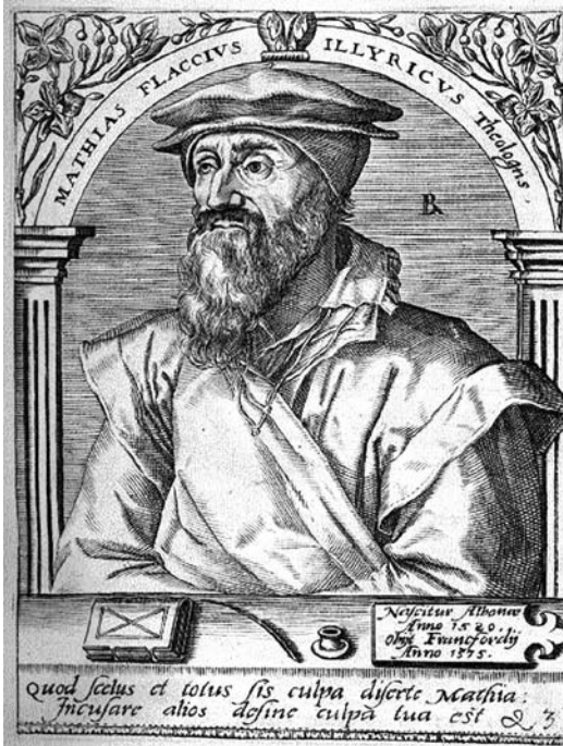
Matthias Flacius Illyricus (1520-1575).