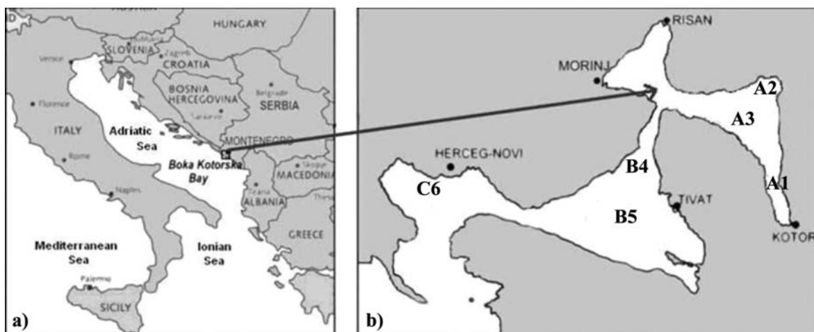
Fig. 1. (a) Position of the Boka Kotorska Bay in the Mediterranean Sea. (b) Map of the Boka Kotorska Bay with sampling locations (A – Bay of Kotor; B – Bay of Tivat; C – Bay of Herceg Novi)

The Boka Kotorska Bay system is often referred to as a fjord, due to its dramatically steep mountain walls, although it is actually a submerged river canyon. Owing to a large amount of winter precipitation over its karstic drainage basin, it is greatly influenced by the large influx of freshwater from streams and submarine springs. Water exchange with other arms of the Boka Kotorska system and the open Adriatic Sea represent incoming currents near the bottom and outgoing currents on the surface. The whole system consists of four sub-bays: two inner bays, the Bay of Kotor, which is highly eutrophicated (VILIČIĆ, 1989), and the Bay of Risan, the mid situated Bay of Tivat, and the outermost Bay of Herceg Novi that directly communicates with the open sea waters.