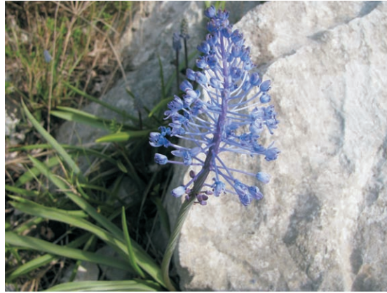
Fig. 1. Chouardia lakusicii (Šilić) Speta from the locality in the mountains of Torac and Ivanova lazina above the villages of Majkovi and Mravinjac.