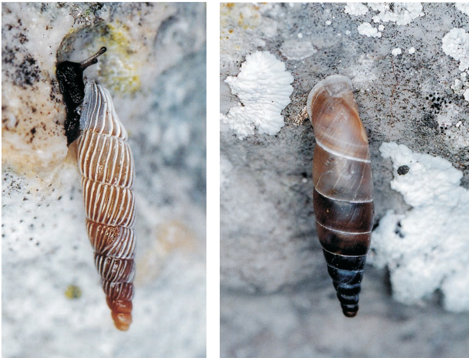
Fig. 6a-b. a) Agathylla lamellosa , formerly a strictly southern Dalmatian species that was recently discovered on Dugi otok, and now on the Kornati; b) Delima albocincta albocincta a species endemic to Dugi otok, Ugljan and Kornat.