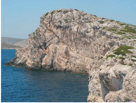
Fig. 2. Cliffs – a distinctive habitat with specific species of terrestrial snails.