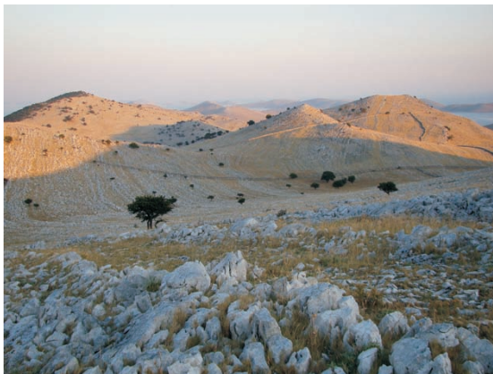
Fig. 3a-b. Stony grasslands – the dominant habitat in Kornati National Park