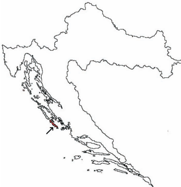
Fig. 1. Position of Kornati National Park in Croatia.