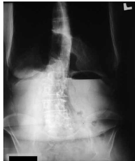
Fig. 1. Initial recorded plain abdominal X-ray picture standing.

Clinical examination determines that the patient had stable vital parameter. Auscultation of lung found diffusely impaired respiratory sounds, in epigastric there