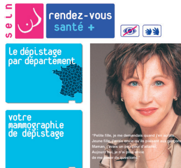
Figure 3. « Le Rendez-Vous Santé + » breast cancer screening promotion internet site

Another successful example of non-formal education is the action taken by the French Ministry of Solidarity, Health and Family, Assurances Maladie and the French National League against Cancer. The action « Le Rendez-Vous Santé + » [ www.rendezvousantepus.net ] [15] informs the female population residing in France, aged 50-74 of mammography being performed every 2 years according to French recommendations.