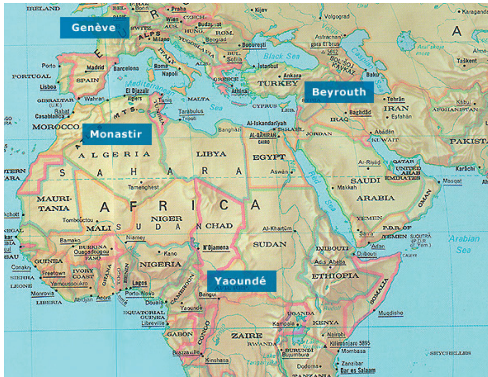
Figure 2. Four geographically displaced Universities participating in the same project – E-learning: Francophone Public Health Network www.universante.org

member universities. The database covers the high-priority tasks in public health: breast cancer, AIDS, cardiovascular diseases. This three-level orientated educational course covered three steps in public health: case presentation, bibliography synthesis and decision-making i.e., the development of the appropriate action