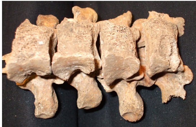
Figure 5 Example of plough cuts on the vertebrae of a non-adult skeleton from the site of Auldham, Scotland