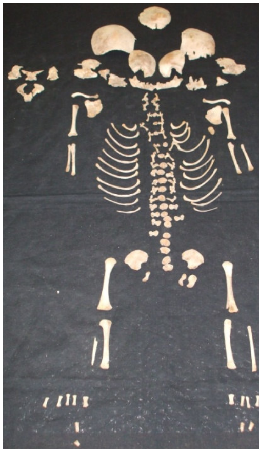
Figure 2 Well preserved non-adult skeleton from the site of Great Chesterford, Cambridgeshire