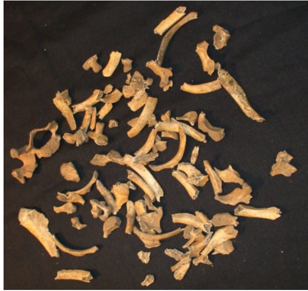
Figure 1 The fragmentary remains of a non-adult skeleton from the site of Auldhame, Scotland