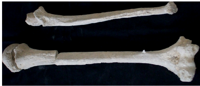
Figure 4 Example of a skeleton interred in a chalk environment from the site of Bishopstone, Sussex