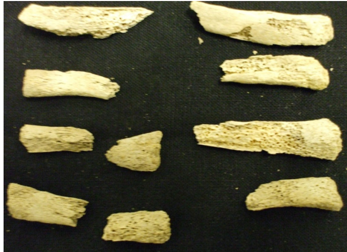
Figure 3 Example of metabolic disease on the ribs of a non-adult from the site of Wharram Percy, Yorkshire