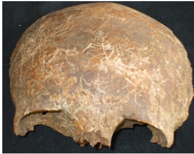
Figure 6 Example of root etching on the skull of a non-adult from the site of Great Chesterford, Cambridgeshire