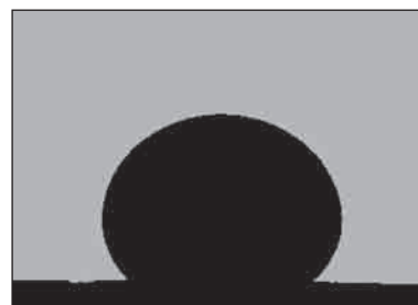
Figure 2 A Cu-40 Ag alloy drop placed on aluminium oxide surface at 1 423 K

The contact angle measurements were conducted at 1 373 – 1 573 K using the sessile drop method. For the experiments, oxygen-free copper and copper-silver alloys with the maximum Ag content of 50 % mass were applied. A high-temperature microscope coupled with a camera and a computer equipped with a program for recording and analysing images was utilized, which enables measurements of relevant liquid metal drop geometrical parameters that are necessary for determination of contact angles. As protective atmosphere during the measurements, argon 6.0 was used. A detailed description of the research apparatus is presented in the article by Siwiec and others [9]. A sample Cu-Ag drop