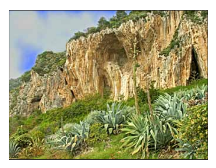
Vaults for the dead in Balzi-Rossi cliffs at Grimaldi (Italy). Grobnice u hridinama Balzi-Rossi na obroncima nalazišta Grimaldi (Italija).

A purpose of mythology is to bring humanity to function under one fire, but every age produces its own omnipresent history. The film pounds into our brains a dramatic inner life that creates a need to become an avatar in order to 'connect' with different species. Since the lifestyle of the species does not appear to be very different, despite all that an avatar embodiment requires, we are driven to the archaeological problem of understanding the past, and especially the way of life of prehistoric humankind.