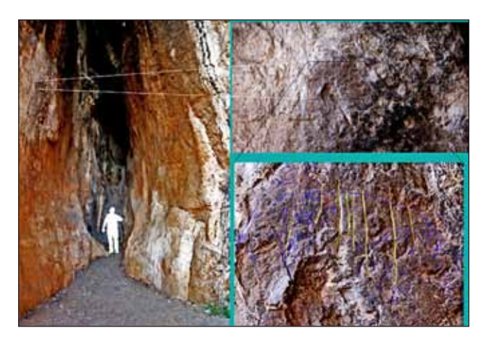
Cavillon Cave, depiction of a horse in profile Pećina Cavillon, crtež konja iz profila.

people is demonstrated mainly by the tools, the choice of area in which to live, and by site management. For Cro-magnon at Cavillon it is also demonstrated by the choice of engraving tools. The extreme delicacy of the horse design and the safe working technique in the handling of chisels to trace its outline provide evidence of a developed artistic sense.