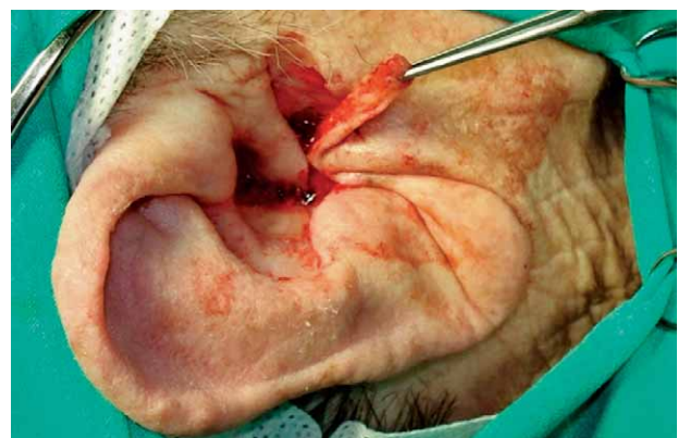
Fig. 4. Surgery – second stage: reconstruction of the external auditory canal.