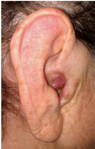
Fig. 1. Hidradenoma of external auditory canal.

of the left ear. The patient had previous history of two operations in a regional hospital: incision of the furuncle of external auditory canal and biopsy of the lesion of external auditory canal, pathohistology finding was without carcinoma. Temporal bone CT scan showed tumor mass of the external ear canal, 6 centimeters in diameter, without bone, temporomandibular joint or intracranial invasion (Figure 2); the tumor was limited medially by the