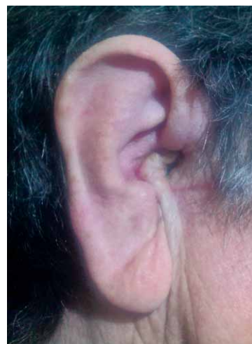
Fig. 5. One year follow-up.