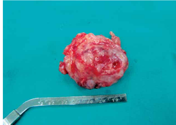
Fig. 3. Excised tumor measuring 5x5cm in diameter. Final diagnosis was pleomorphic adenoma.

Majority of parapharyngeal space tumors are either salivary glands tumors originating from the deep lobe of the parotid gland or neurogenic tumors originating from the cranial nerves, the cervical sympathetic chain or the