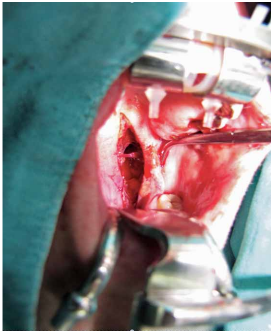
Fig. 2. Tumor excision by the transoral surgical approach.

range. Under the general anesthesia the tumor was removed by the transoral approach (Figure 2). Post-operative period was uneventful. Final diagnosis was pleomorphic adenoma, Tumor mixtus (Figure 3). Two years following the surgery the patient is free of any recurrent disease.