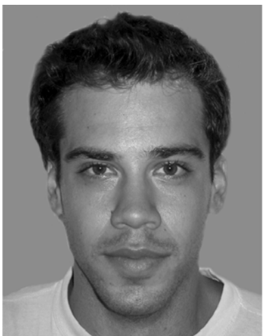
Figure 1. The Example of Normal and Left-Mirrored Face

symmetry itself and not to overall differences in attractiveness of stimuli faces. The example of normal and left-mirrored photographs is shown in Figure 1.