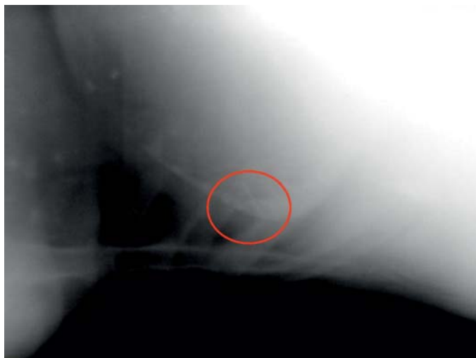
Fig. 9. Foreign body in the vertical direction and view radio-opaque on the reticulum floor

In six of the subjects suspected of TR and TRP, linear foreign objects with a radiopaque appearance were found on the reticulum floor (Fig. 9), 4 of which were cranial and 4 of which were caudal. Furthermore, the boundaries of the diaphragm had become irregular