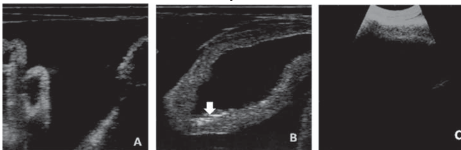
Fig. 8. The bladder could not be seen during the transrectal examination (A) and a self-repaired (arrow) bladder was captured in spite of uroabdomen (B) and anechoic image during the transabdominal examination (C)

as an indirect finding. In this regard, there were findings of enlargement in Pelvis renalis , which was unilateral in some and bilateral in others, as well as enlargement and the accumulation of anechoic content in the calyx.