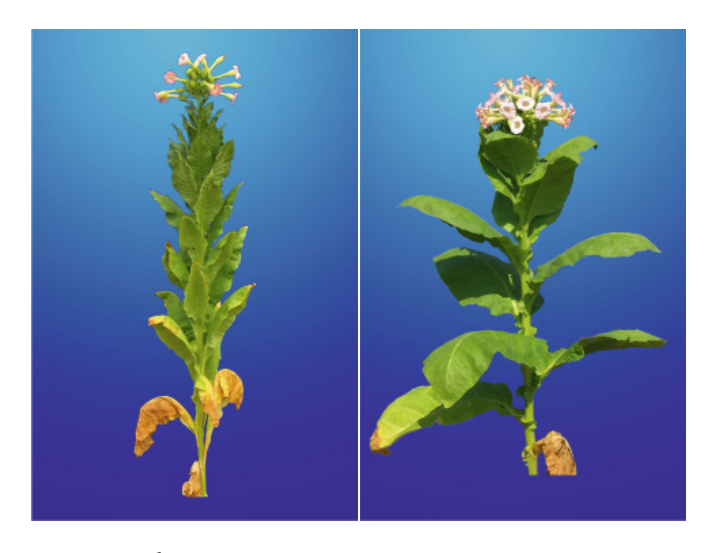
Figure 3. Yaka YV 125/3