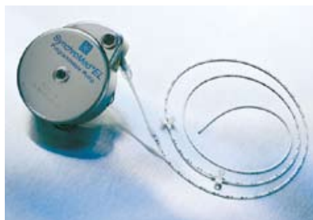
Figure 1. Intrathecal pump.

Intrathecal pumps deliver small doses of medication directly to the spinal fluid. It consists of a small battery-powered, programmable pump (Figure 1) that is implanted under the subcutaneous tissue of the abdomen and connected to a small catheter tunneled to the site of spinal entry (Figure 2). Sophisticated drug dose regimens can be instituted. Implanted pumps need to be refilled every 1 to 3 months. There is no evidence showing whether it is more clinically effective to use bolus or continuous dosing.