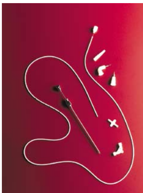
Figure 2. Intrathecal catheter.