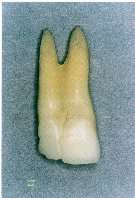
Slika 1. Fuzija 21 i 22 promatrana s vestibularne strane Figure 1. Fusion of 21 and 22 seen from the vestibular side

Izvađeni je zub 22 tijekom 48 sati uronjen u 3% vodikov peroksid, a potom u 10% otopinu formalina. Nakon nekoliko dana zub je rendgenski snim-