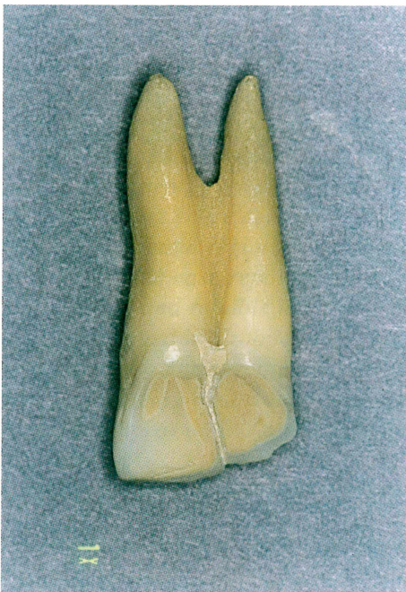
Slika 2. Fuzija 21 i 22 promatrana s oralne strane Figure 2. Fusion of 21 and 22 seen from the oral side

Zubne su krune odijeljene uzdužnom brazdom koja je uočljiva i s labijalne i s oralne strane. Jasno su izražena dva korijena, što potvrđuje njihovu odvojenost pri razvoju te na njihovo kasnije stapanje (konkrescenciju) nastalo povećanim nakupljanjem cementa tijekom žrtvina života (Slika 2).