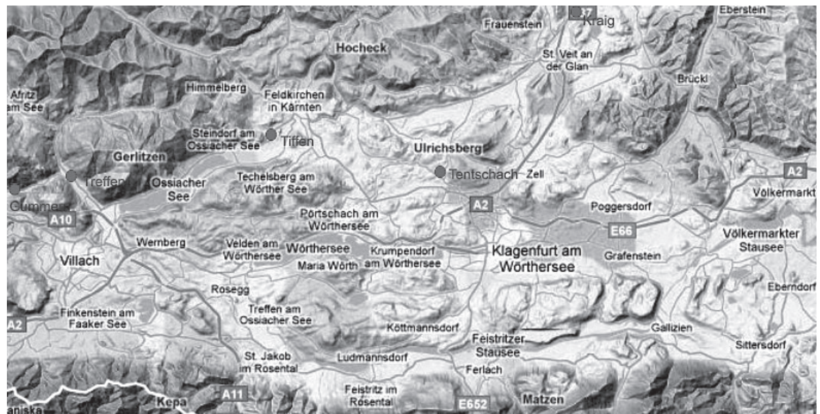
Fig. 1: Marble quarries in Carinthia: map by M. Pochmarski-Nagele, following Google earth.

marily affected and marginally also Savaria and Scarbantia (fig.4).