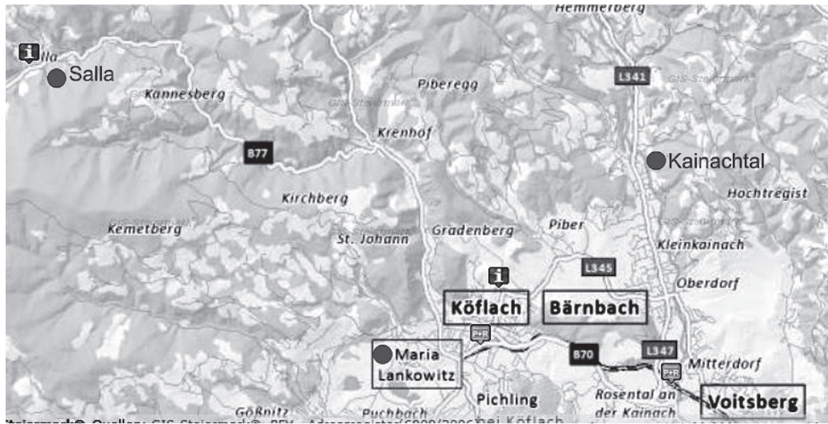
Fig. 2: Marble quarries in the northern part of Western Styria: map by M. Pochmarski-Nagele, following GIS Styria