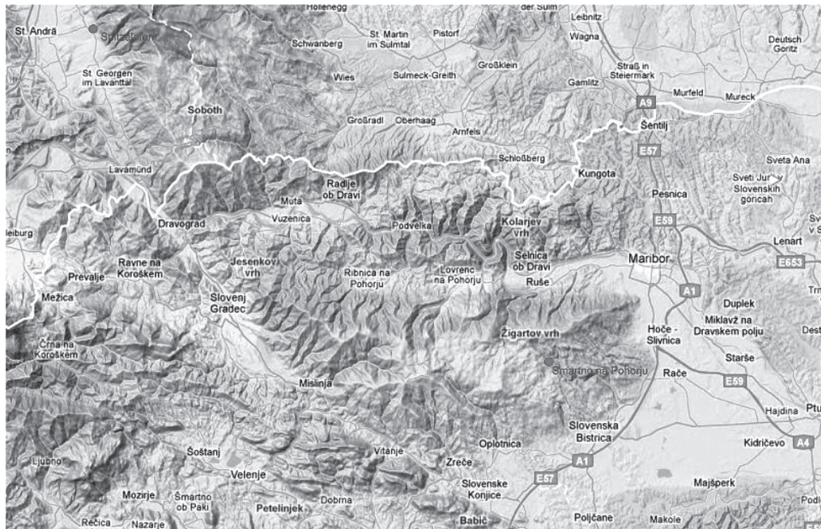
Fig. 3: Marble quarries in Štajerska: map by M. Pochmarski-Nagele, following Google earth.

while in the actual city of Flavia Solva the marble from Kainach as the marble from Gummern counts only about 15 %.