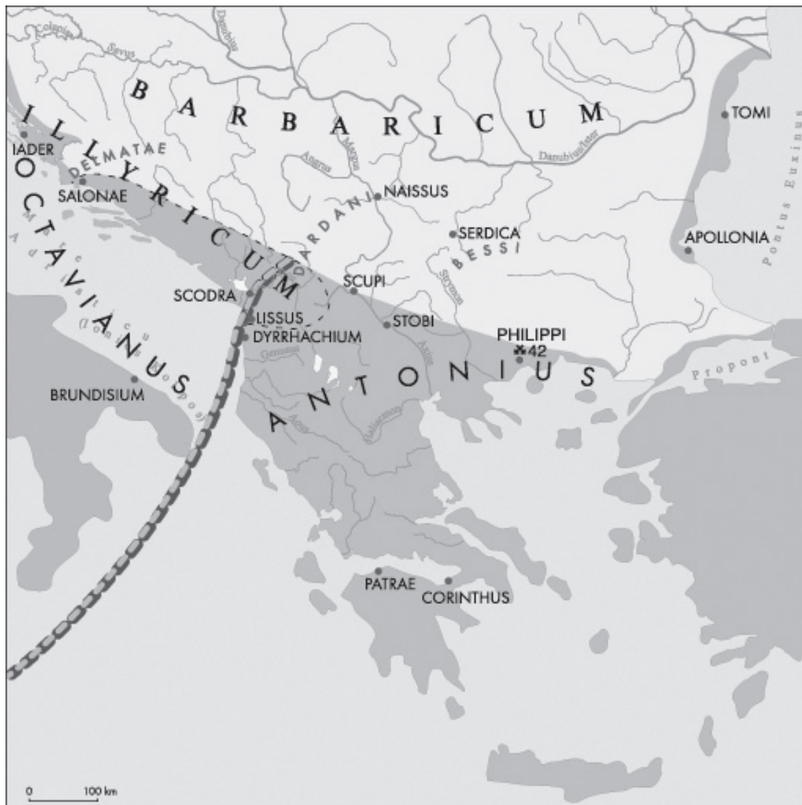
Fig. 2: The dividing line between the spheres of influence of Octavian and Antony (the pact of Brundisium in 40 BC; computer graphics M. Belak).

the three groups – from the weakest to the strongest – the peoples were noted with no apparent order, certainly not geographical and also not alphabetical; possibly they were again named according to the degree of their resistance. In the first group of peoples that had been conquered with the least effort, the Taulantii are mentioned, along with the Oxyaei, Pertheenatae, Bathiatae, Cambaei, Cinambri, Merromeni, and Pyrissaei; these were defeated in a single military expedition. 17 Of these peoples only the Taulantii can be located approximately, while all others, except the Oxyaei (Pliny's Ozuaei in the conventus of Naronae) 18 are elsewhere unattested. Cassius Dio does not mention any of the peoples from Appian's first group.