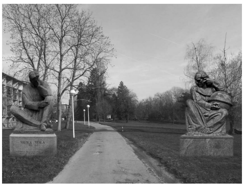
Picture 2. The famous sculptor Ivan Meštrović created and donate to Ruđer Bošković Institute a pair of sculptures, representing the real Bošković-Tesla symbiosis.

tor Ivan Meštrović, who created a pair of sculptures representing Bošković-Tesla symbiosis. The sculptures are intentionally mutually linked in their dimensions, the outlook and the vision of minds immersed in deep thought.