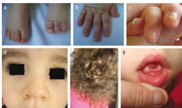
Figure 1. Clinical appearance of our patient: hypertrophic nail dystrophy (pachyonychia) with yellowish discoloration on the toenails (a) and fingernails (b,c); small yellowish cysts on the central face (d); dry, unruly and curly hair (e); and absence of both mandibular central incisor teeth, the teeth that were present at birth (f); note distal hyperpigmentation of the left thumbnail of the patient's father (f).

A 2-year-old female born at term to non consanguineous parents was referred to our outpatient clinic for evaluation of thickened nails starting at the age of 3 months. She presented a history of natal teeth (both mandibular central incisors), and facial pinhead-sized yellowish papules noted at birth, that had slowly grown during the first year of age. Physical examination showed: 1) thickened and discolored nails on all of her fingers and toes, 2) multiple small cystic papulonodules measuring 2 to 10 mm in diameter over the nose and paranasal area, 3) dry, unruly and curly hair, and 4) slight palmoplantar hyperkeratosis (Fig. 1). Curiously, both teeth present at birth were missing in the deciduous dentition, which had meanwhile erupted. There were no lesions in the mucous membranes, hoarseness, follicular keratoses or palmoplantar hyperhidrosis. Her father also presented thickening and