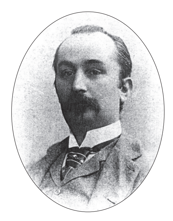
Figure 4. Dr. Emanuel Luxardo

Even Virchow praised his perfect production of anatomical outfit.