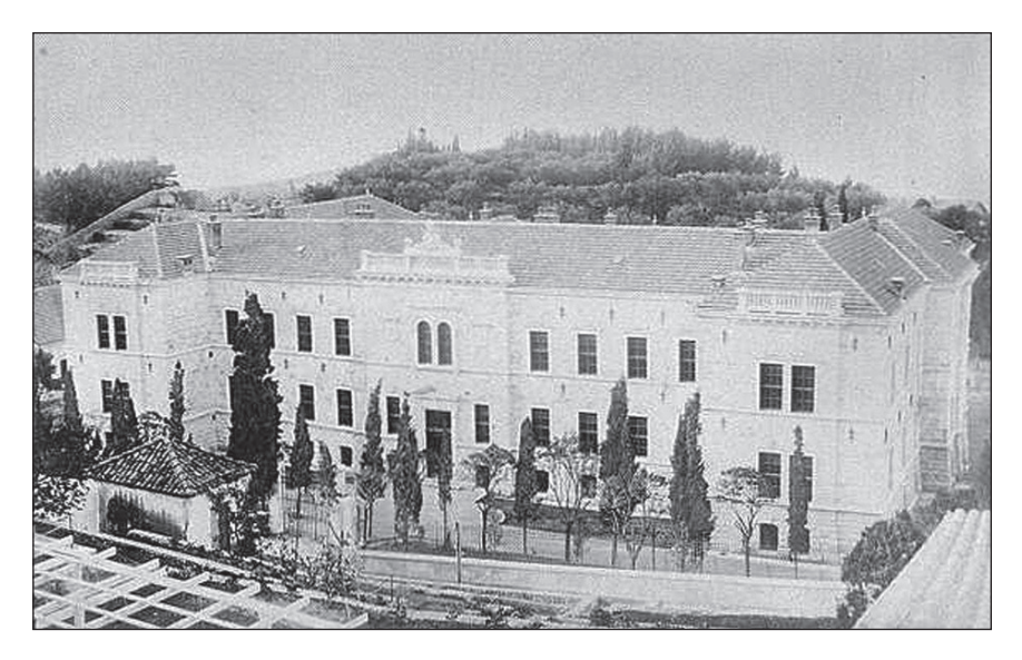
Figure 2. The new hospital, built in 1888 on Boninovo

The new-built structure in Dubrovnik had five edifices of different sizes. Near the main building there was "uterus" – smaller building for women in childbed; more remotely there was "solitary" – an edifice for contagious diseases; there were morgue, chapel and an edifice for stables. All around there were parks and gardens.