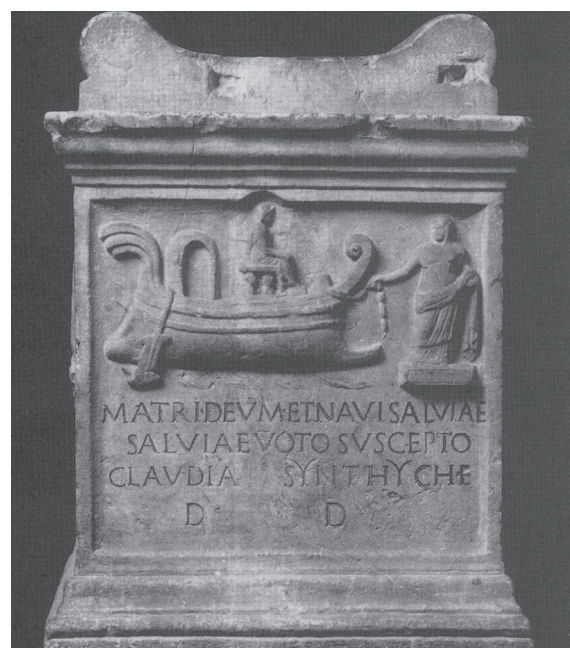
Fig. 7. Altar from the Aventine (after Roller 1999, fig. 74)