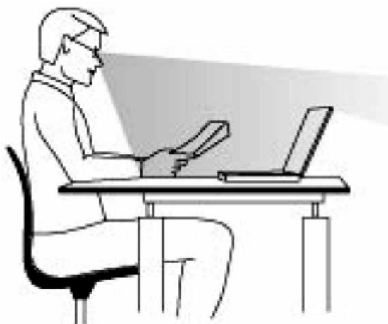
Fig. 3. Visualization of progressive lenses for office use.