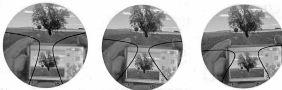
Fig. 2. Types of progressive corridors.

All these parameters are very important to know when a selection of glasses is made. The most appropriate types of lens should be chosen according to these parameters and client needs. Of course, as growing vision comfort of client (wider zones of lens) the price increases.