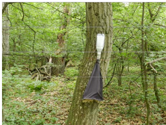
Fig.3 Tree photoelector installed in the ecotone