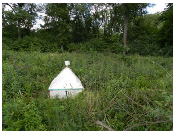
Fig.2 Soil photoelector exposed in the clearing close to the forest

Masarovič et al.: The First Record Of Predaceous Scolothrips Longicornis Priesner 1926 (... (Fig.3), based on a principle of positive phototaxis and negative geotropism of insects (Majzlan and Fedor, 2003) and installed on a trunk at the height of 1 m. For both traps ethyleneglycol was used as a conservation liquid. Standard preparatory techniques were applied for mounting thrips (Fedor et al., 2012; Sierka and Fedor, 2004). The material has been deposited in the collections of the authors.