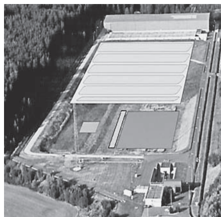
Figure 3 Design proposal of construction accomplishment of RR of Radwaste