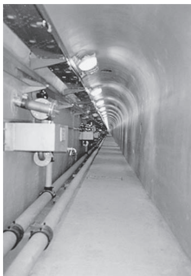
Figure 2 Monitoring tunnels

tering and monitoring systems in order to be in compliance with the requirements of Nuclear Regulating Authority of SR. First some alternative static measurements have to be performed of perspective laying down and deflection of the repository after its successive filling and moreover the method of new drainage tunnels boring performed longitudinally the repository in compressed clay, furthermore the method of interconnecting of underground tunnels, chambers and disposal boxes, protection of inforced concrete boxes as well as protection of tunnels against the penetration of rain water and a lot of other technical issues were resolved (Figure 2) [1 - 4].