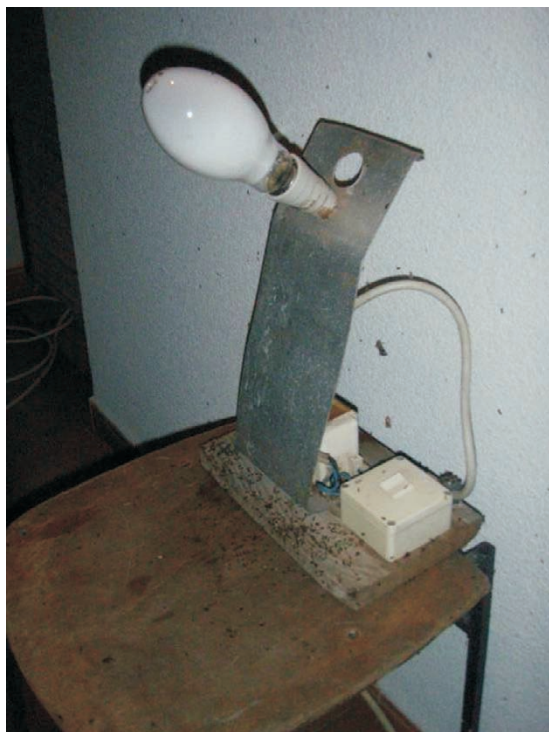
Fig. 1. Light trap used for attracting moths

Diurnal moths were collected during daytime by an entomological net on meadows around Pazin and Vela Traba. Nocturnal moths were collected in two ways. The first method is a light trap consisting of a strong mercury vapor light (230 watts) on a wooden construction placed on a window that faced meadows and