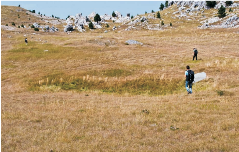
Fig. 2. The grassland near Duler (1250 a.s.l.) on Dinara Mountain – locality of Rammeihippus dinaricus (Götz, 1970) in Croatia