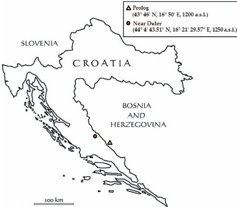
Fig. 1. Rough position of type locality (Vaganj) of Rammeihippus dinaricus (Götz, 1970) in Bosnia and Herzegovina (yellow triangle) and the newly recorded locality near Duler in Croatia (53km NW of type locality) (red circle)