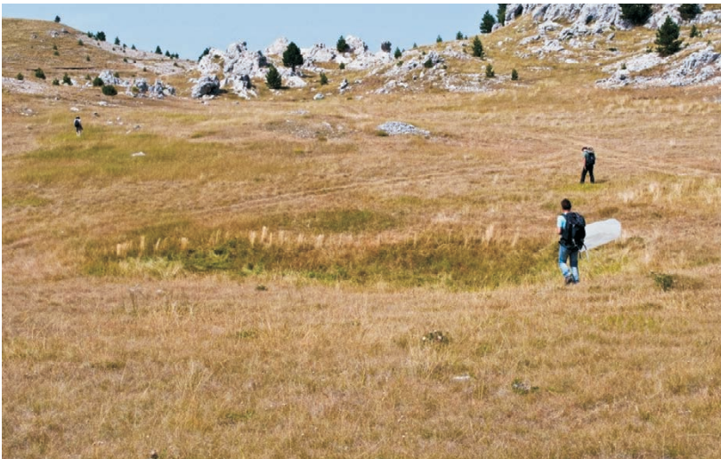
Fig. 2. The grassland near Duler (1250 a.s.l.) on Dinara Mountain – locality of Rammeihippus dinaricus (Götz, 1970) in Croatia