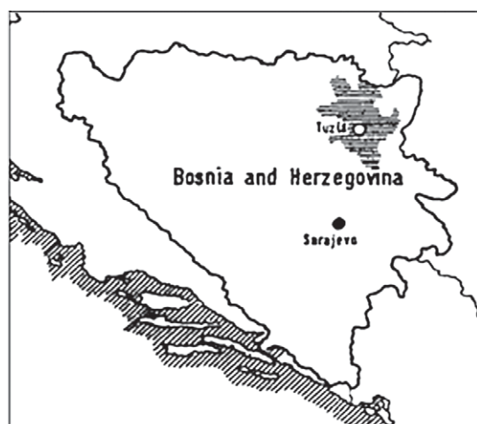
Fig. 1. Geographical location of the Tuzla Canton area (Bosnia-Herzegovina).

Bosnia-Herzegovina is a southern European state located between Croatia, Montenegro and Serbia (Figure 1), with an area of 51125 km and a population of 4.007.608 in 2004. The Tuzla Canton area is situated in the northern part of Bosnia-Herzegovina and has an area of 2,909.5 km, with a population of 502 418, including 85 526 children in the 0–14 age group (as of 31st Decembar 2004). In 2004 the infant mortality rate was 6.8 per 1000 live births. Children suspected of having a heart disease are referred to the Paediatric Cardiology Unit, Department of Paediatrics in Tuzla. The state cardiac surgery service for congenital heart disease in period 1994–2004 was not available, during same interval in Tuzla Canton area 98 neonates and children with congenital heart disease died because no surgery could be performed. Despite post war condition, during this time children malnutrition was not registrated as a public health problem in this region.