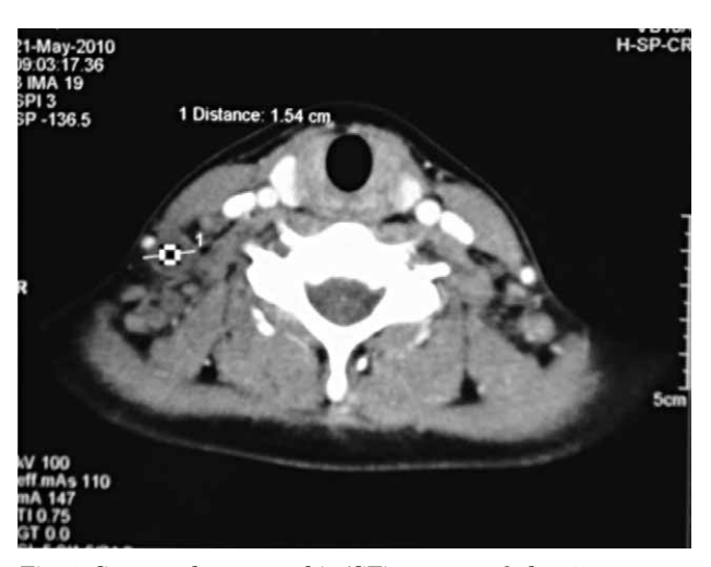
Fig. 1. Computed tomographic (CT) scan revealed a 15 mm mass in the right lower jugular node (level IV) with peripheral enhancement

Nasal and oral examinations were unremarkable. Blood analysis at admission time presented with slight anaemia. White blood cell count was 5.0 \times 10^9 / L (reference range 4.4–11.6×10<sup>9</sup>) and consisted of 76% neutrophils, 10% monocytes, 13% lymphocytes, less than 1% basophils, and less than 1% eosinophils. Her haemoglobin level was 111 g/L, (reference range 118-149 g/L), and her platelet count was 272×10<sup>9</sup>/L (reference range 178-420 ×10<sup>9</sup>/L). A computed tomographic (CT) scan revealed a 15 mm mass in the right lower jugular node (level IV) with peripheral enhancement (Figure 1). Adjacent lymph nodes along the right jugular chain were also enlarged. The patient underwent an excisional biopsy. During surgery, a solid mass was identified and removed. Histopatological analysis of extracted specimen revealed necrotizing changes with abundant karyorrhectic debris, scattered fibrin deposits and a collection of large mononuclear cells (Figure 2). No active treatment was initiated and the patient was discharged home after seven days of in-patient stay. At follow-up she reported no symptoms, remained well and there were no abnormalities found at clinical examination.