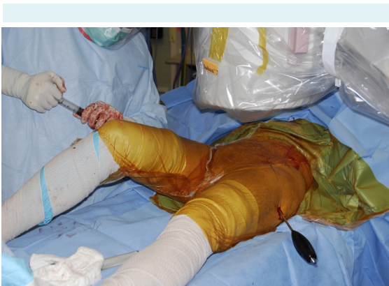
FIGURE 3. Injection of bone marrow concentrate into the area of necrosis (published with permission from Sierra RJ). Alternative procedure for osteonecrosis of the femoral head, Figure 4 (24).

At this time, the contents of the bone marrow concentrate and the platelet-rich plasma have completed the centrifugation process. Approximately 12 mL of each should be obtained. They are combined in a 30 mL-syringe in a sterile manner. This can be doubled if both hips are to be injected. The contents of the 30 mL-syringe are then injected into the trochar, which should be positioned in the necrotic lesion of the femoral head. Due to the sclerotic nature of the lesions, it may require significant pressure to inject the contents from the syringe (Figure 3). If excessive resistance is met, the trochar can be retracted while confirming that the tip remains in the area of necrosis. This will increase the space available to inject while ensuring that the mesenchymal stems cells are delivered to the cor-