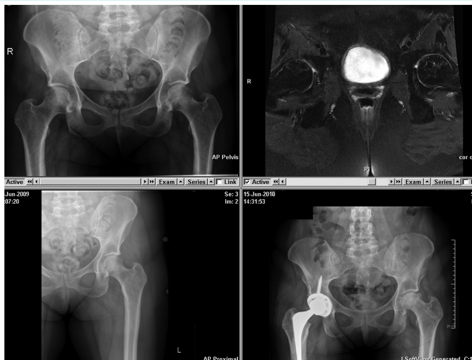
FIGURE 4. A 43-year-old female on steroids for cancer treatment presents with bilateral hip involvement. Upper left: anteroposterior (AP) pelvis radiograph taken on presentation. Lower left: AP of the left femur taken on presentation. Upper right: T2 coronal oblique MRI showing significant bilateral head involvement prior to treatment. Lower right: AP pelvis shows complete collapse of the left femoral head resulting in total hip arthroplasty 1 year post-operative.

The original work by Hernigou was a retrospective study that popularized the addition of bone marrow concentrate to a core decompression (22). The information obtained from the study have been proven very beneficial in identifying the procedure and etiologic data, however the study did not compare the results with core decompression in a prospective manner. Since this study, at least 4 studies have prospectively compared the results of standard core decompression and core decompression with autologous bone marrow introduction.