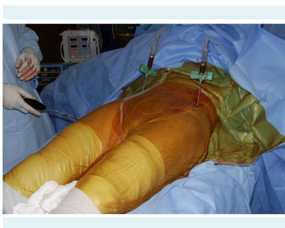
FIGURE 1. Patient with iliac crest aspirators in place, with bilateral hips prepared for decompression and injection of concentrated bone marrow (published with permission from Sierra RJ). Alternative procedure for osteonecrosis of the femoral head, Figure 2 (24).

The patient is placed supine on a radiolucent table and general anesthesia is performed. Fluoroscopic imaging is used at this time to ensure that adequate anterior-posterior (AP) and frog-leg lateral images can be obtained with the patient's position. The operative hip/hips and both iliac crests are prepped and draped into the surgical field in a sterile manner (Figure 1). Two grams of cefazolin should be given at this time. The procedure begins by obtaining iliac bone marrow aspirate. A 2-3-mm incision is made over that anterior aspect of each anterior iliac crest. When the iliac crest is visible, the trochar (Marrowstim, Biomet Biologics, Warsaw, IN, USA) can be inserted into the iliac crest in between the two tables of ilium and bone marrow can be aspirated into 10 mL-syringes. We use the Bio-Cue System (Biomet Biologics) to concentrate the bone marrow aspirate obtained. Each vial requires 57 mL of bone marrow aspirate mixed with 3 mL of heparin to prevent clot formation. A single vial produces 6 mL of concentrated bone marrow aspirate, and we typically utilize two vials per hip. Once collected, the vials are placed in a centrifuge for 15 minutes to adequately concentrate the mononuclear fraction of blood that contains the mesenchymal progenitor cells. Additionally, 120 mL of anticoagulated blood are placed into two