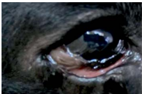
Fig. 6. The right eye showing recovery