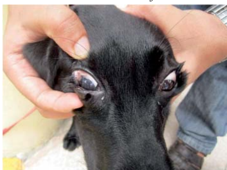
Fig. 1. Bilateral dermoids and mucopurulent discharge

A 5-month-old male Labrador retriever was referred to the Division of Surgery at the Referral Veterinary Polyclinic with the complaint of a hairy growth in the eyes, excessive lacrimation and mucopurulent discharge. On close examination, hairy growth was observed on bulbar conjunctiva in both the eyes (Fig. 1).