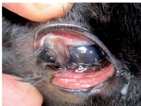
Fig. 2. The right eye with protruding hairy growth