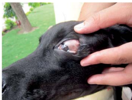
Fig. 3. The left eye with closely adherent hairy growth on the conjunctiva

In the right eye, the growth was seen near the lateral canthus and hairs were protruding from the growth through the palpebral fissure (Fig. 2). In the left eye, hairy small adherent growth was seen near the lateral canthus and this was contiguous with the eyelid (Fig. 3).