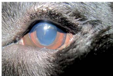
Fig. 7. The left eye showing recovery

Recovery was uneventful, the corneal opacity subsided in a week and the cosmetic appearance of the eyes was also appealing. The excessive lacrimation also ceased. The photos showing complete recovery are given in Fig. 6 and Fig. 7.