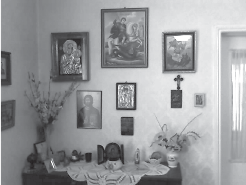
Image 1. Hallway display of first-wave respondent