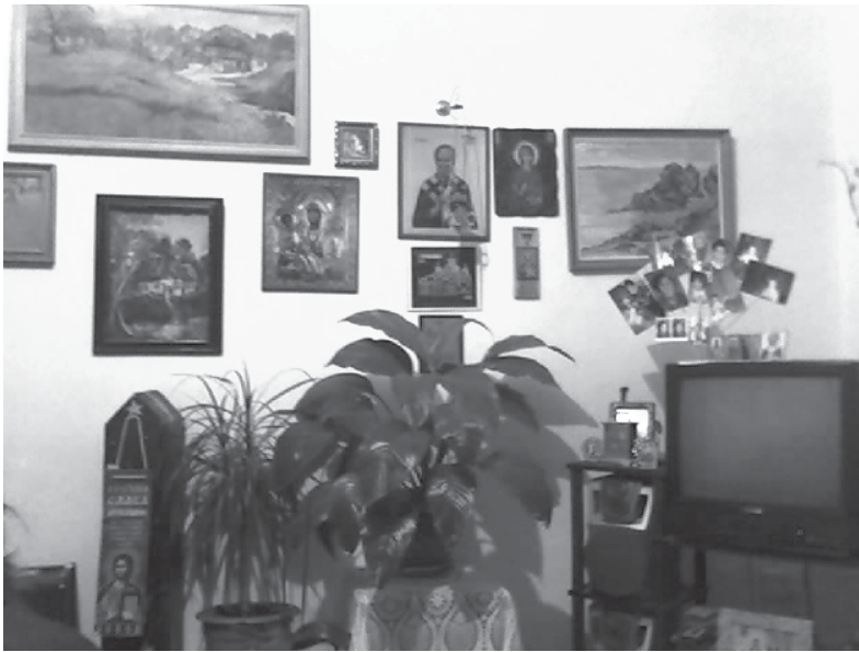
Image 2. Living room of third-wave family's home

Source: Fieldwork with total sample, 2007