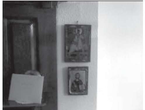
Image 4a and 4b. Main staircase and spare room bookcase in second wave couple's home