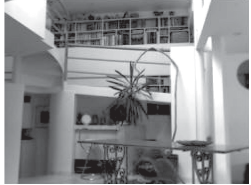
Image 3a and 3b. Hallway and open plan interior of second wave couple's home