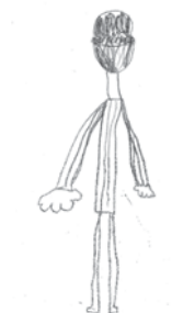
Figure 12. Playing with a hat from behind, 6 years, 8m