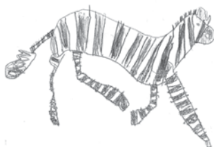
Figure 3. Zebra, 6 years 10 m, by observation