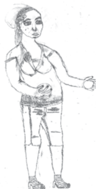
Figure 9. Juggleress, 10 years 11 m