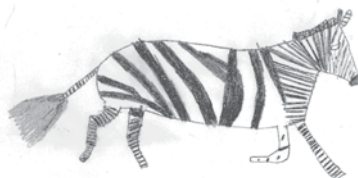
Figure 5b. Zebra, Marin V, 10 years, by observation

3. In what manner will children of various ages present the human figure (male and female) in complex movement of the whole body during ball juggling?