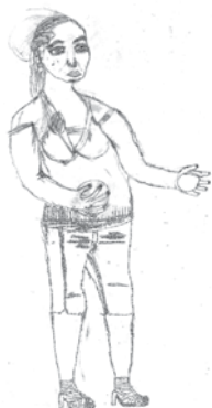
Figure 8. Juggler, 9 years