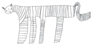
Figure 2. Zebra, 6 years 2m, from memory