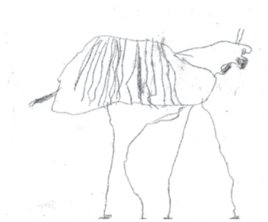
Figure 4. Zebra, 4 years 11, by observation

Again, senior nursery and junior kindergarten group did not show differences in their approach. Four-and-a-half-year-olds achieved certain similarity with the model by observation, but in so many formative variations that obviously observation of the model did not diminish their expressiveness. Among children beyond 5.5 years of age, observation of model expectedly diminished form variations in ES, but expressiveness was made up for in the field of visual art's rhythmisation of zebra's stripes (several children from ES did not even draw the stripes). In primary school ES drawings showed a significantly larger number of details and invested effort. Marin (10 years old) notices many variations in rhythms in the photograph and expresses them by line shape and thickness. The same goes for human form: due to a large number of visual problems, expressiveness of drawings also increased as a result of intense search for solutions.