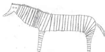
Figure 5a. Zebra, Marin V, 10 years, from memory observation (right)