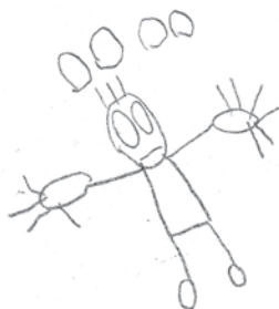
Figure 6. Juggler, 4 years 8 m

around the character whose hands were spread out; all except one child drew fingers on hands catching the balls. After 5.5 years children had no problem presenting movement dynamics, they even added details such as shirt stripes, belt and shoelaces. At primary school age the distance from habitual presentation is dramatical: there was even perspective shortening of hands drawn from the front (although no instructions as how to draw were given), a myriad of clothing and head details as well as limbs curved in movement.