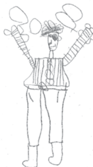
Figure 7. Juggler, 6 years, 10 m