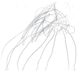
Figure 1. Zebra, 2 years 10m, by observation

Out of 215 children, 40 observed a photo of a running zebra, 97 drew a zebra from their memory, and 38 drew it first from memory and then from a photograph. At senior nursery age the inner model is predominant: the amount of doodling is equal with or without a presented model. The same applies for the junior kindergarten group. We can say that the inner model dominates in the middle kindergarten group as well: the plethora of visual art's drawing variation of zebra is astonishing. But with the senior kindergarten group (older than 5.5 years), the experiment starts yielding results. Some children from CS refused to draw a zebra from memory "because they don't know it"; other consciously drew a giraffe or a camel, while some emphasized they did not even bother making an effort. Not a single drawing from CS had knees, 13 out of 26 zebra drawings had en face smiling human face drawn in profile view. In ES, 7 out of 16 zebras in drawings had knees drawn, and none had a human face. Proportions in ES were by far more accurate, and the same goes for the number of details in the drawings. The same progress was noted in the primary school. Here as well some members of CS drew a giraffe instead of a zebra, here also several smiling human faces appeared, and lack of knees predominated (at almost all of them) even in the fourth grade. All members of ES drew knees to their zebras (most of them correctly bent backwards).