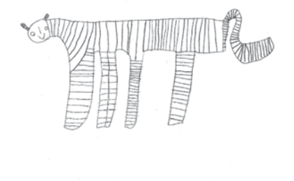
Figure 2. Zebra, 6 years 2m, from memory