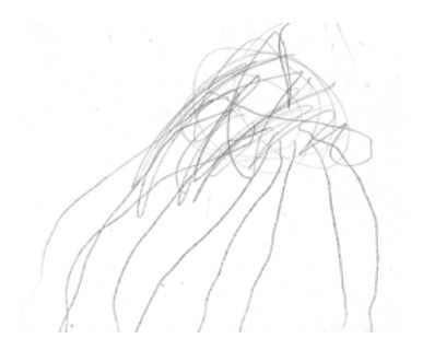
Figure 1. Zebra, 2 years 10m, by observation

Out of 215 children, 40 observed a photo of a running zebra, 97 drew a zebra from their memory, and 38 drew it first from memory and then from a photograph. At senior nursery age the inner model is predominant: the amount of doodling is equal with or without a presented model. The same applies for the junior kindergarten group. We can say that the inner model dominates in the middle kindergarten group as well: the plethora of visual art's drawing variation of zebra is astonishing. But with the senior kindergarten group (older than 5.5 years), the experiment starts yielding results. Some children from CS refused to draw a zebra from memory "because they don't know it", other consciously drew a giraffe or a camel, while some emphasized they did not even bother making an effort. Not a single drawing from CS had knees, 13 out of 26 zebra drawings had en face smiling human face drawn in profile view. In ES, 7 out of 16 zebras in drawings had knees drawn, and none had a human face. Proportions in ES were by far more accurate, and the same goes for the number of details in the drawings. The same progress was noted in the primary school. Here as well some members of CS drew a giraffe instead of a zebra, here also several smiling human faces appeared, and lack of knees predominated (at almost all of them) even in the fourth grade. All members of ES drew knees to their zebras (most of them correctly bent backwards).