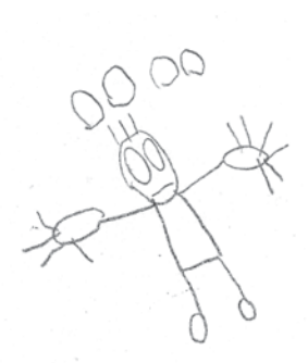
Figure 6. Juggler, 4 years 8 m

around the character whose hands were spread out; all except one child drew fingers on hands catching the balls. After 5.5 years children had no problem presenting movement dynamics, they even added details such as shirt stripes, belt and shoelaces. At primary school age the distance from habitual presentation is dramatical: there was even perspective shortening of hands drawn from the front (although no instructions as how to draw were given), a myriad of clothing and head details as well as limbs curved in movement.