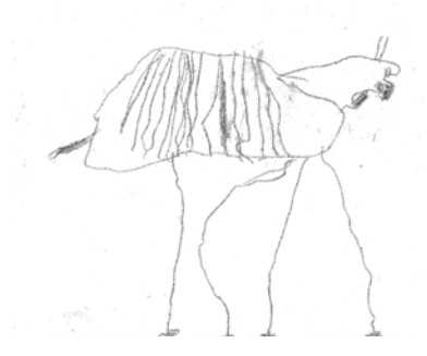
Figure 4. Zebra, 4 years 11, by observation

Again, senior nursery and junior kindergarten group did not show differences in their approach. Four-and-a-half-year-olds achieved certain similarity with the model by observation, but in so many formative variations that obviously observation of the model did not diminish their expressiveness. Among children beyond 5.5 years of age, observation of model expectedly diminished form variations in ES, but expressiveness was made up for in the field of visual art's rythmisation of zebra's stripes (several children from ES did not even draw the stripes). In primary school ES drawings showed a significantly larger number of details and invested effort. Marin (10 years old) notices many variations in rhythms in the photograph and expresses them by line shape and thickness. The same goes for human form: due to a large number of visual problems, expressiveness of drawings also increased as a result of intense search for solutions.