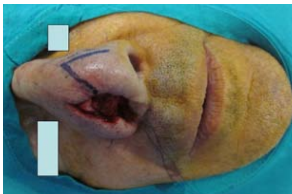
Figure 4. The mucous flap was sutured into its final site using reabsorbing sutures and successfully reconstructing the inner side of the nasal cavity. The solution of continuity at the nasal sept level was partially sutured and partially left to self-heal later on. The design of the Mutaf triangular flap still to be autonomized can be appreciated.

After local anesthesia with lidocaine 2% solution diluted and buffered with sodium bicarbonate, we started the procedure converting the defect to be reconstructed in a triangle with lower base as designed during the planning.