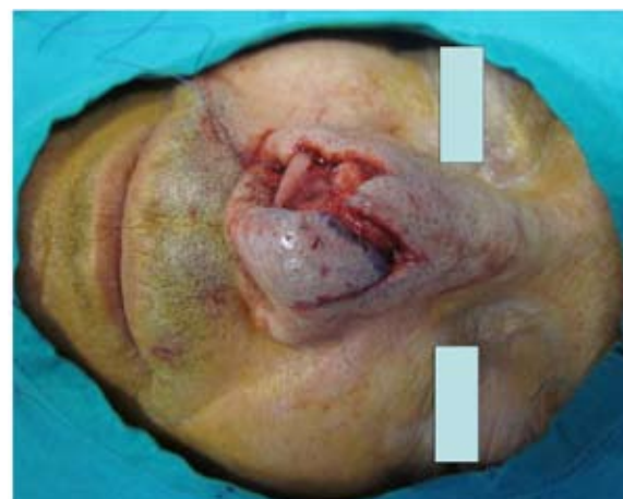
Figure 6. The thin layer of cartilage taken at the level of the quadrangular cartilage sept, sutured in its final site to guarantee a good structural support to the nasal ala.