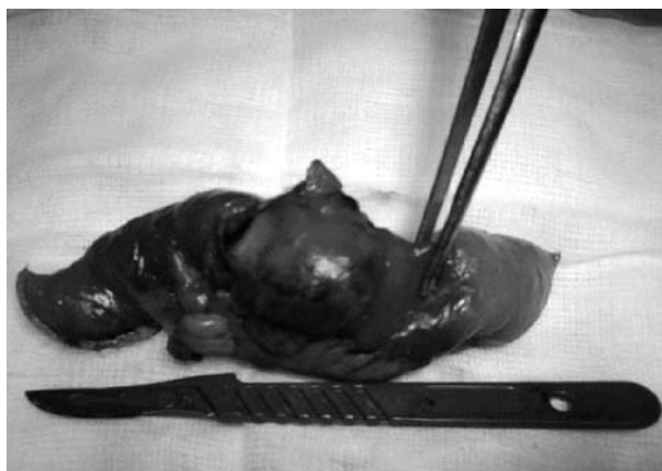
Fig. 2. Jejunal resection including the hematoma of 4.5x2.5 cm in size.

Intramural bowel hematoma was observed for the first time in 1838 by McLouchlan during autopsy of a man who died of bowel obstruction.