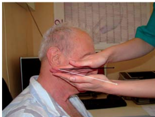
Fig. 2. Flexion of the neck.