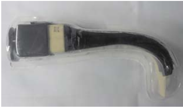
Fig. 5. Airtraq DL laryngoscope.

nel compared with conventional Airtraq, with some modifications of its tip and yellow indication mark.