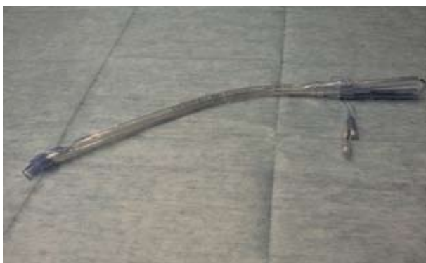
Fig. 3. Mallinckrodt double lumen tube, left sided, with carinal hook.

Left and right DLT are available. We should be aware of the anatomic airway asymmetry inside the tracheobronchial tree. For most thoracic procedures