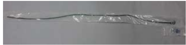
Fig. 6. Double lumen tube exchange catheter, Cook Critical Care.

The commercially available exchange catheters are designed specifically for this purpose, with adequate length (at least 83 cm long), size (11-14 Fr), and soft-tip. Direct laryngoscopy or video laryngoscopy is