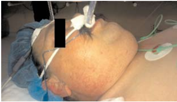
Fig. 2. A single lumen tube with bronchial blocker placed in an extremely obese patient requiring one lung ventilation.

has already been successfully performed, lung separation can still be a problem.