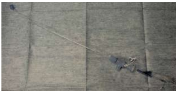
Fig. 4. Coopdech endobronchial blocker tube with multi-port adapter.

Cohen flexitip blocker). Bronchial blockers (BB) have the same disadvantages compared with DLT in the lung separation approach. Nevertheless, they are indispensable in specific clinical situations (Fig. 4).