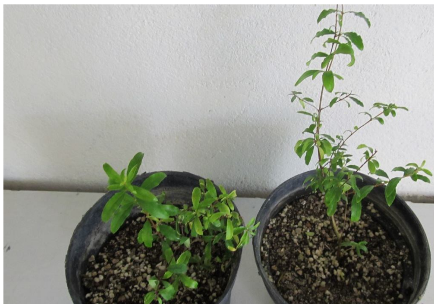
Figure 3. Dwarf pomegranates growth in greenhouse condition after 2 months