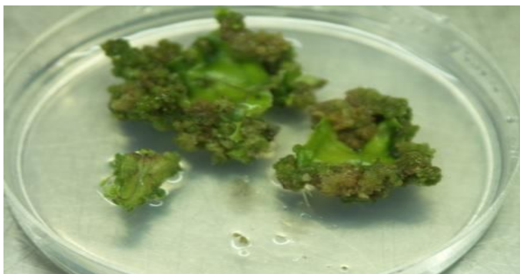
Figure 1. Green calli initiated from leaf explants of dwarf pomegranate culture on MS medium containing 1 mg L -1 BA with 0.2 mg L -1 NAA.

Leaf explants in all treatment containing BA initiated callus about 15 days after culture. Calli were formed on the cut surfaces of leaves (Figure. 1). Among all treatments, those containing 1 mg L -1 BA in combination with 0.2 or 0.4 mg L -1 NAA had the maximum callus induction percentage (100%) (Table 1). BA had a critical role in callus induction since no callus was formed when leaf explants were placed on MS medium without BA. Adding BA to medium increased percentage of callus induction while further increase in BA levels decreased this trait. Mean callus induction in treatments containing 1 mg L -1 BA was 78.89%, which showed significant differences ( P<5\% ) with other levels of BA. Callus produced in media with low levels of BA was friable and greenish yellow in color but at the highest level of BA callus produced was green and hard and almost ready to initiate shoots. Maximum callus growth was obtained in MS medium supplemented with 1 mg L -1 BA and 1 mg L -1 NAA (Table 2). This treatment had the highest callus fresh weight (0.61 g), dry weight (0.068 g) and diameter (16.16 mm) and was significantly different ( P<5\% ) with other treatments except a treatment containing 1 mg L -1 BA and 0.5 mg L -1 NAA (Table 2).