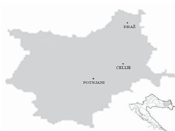
Figure 1 Study sites Draž, Čelije and Potnjani in eastern Croatia.

In the three communities, the residents use drinking water from wells (tube wells and dug wells) by pumping it into their household water pipes. A total of 90 samples of drinking water were collected: 56 samples in May and June of 2005 and 2006, and 34