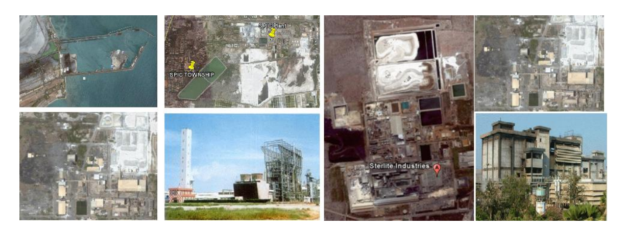
Figure.2. Industries in Thoothukudi City and images of evaporated chemicals. Slika 2. Industrije u Thoothukudi City

The atmosphere consists of three main gaseous elements; nitrogen comprises 78 % of air by volume; oxygen comprises 21 % of air by volume and argon the remaining 1%. Stratospheric ozone might be destroyed chlorofluorocarbons, chlorine, refrigerators. These inert gases can reach the stratosphere where they are decomposed by high energy UV radiation and reactive with chlorine and bromine. In 1974, Sherwood Mario Molina described Chlorofluorocarbon (CFC) drift of stratosphere, where CFC breaks apart by sun high energy radiation and releases large quantities of chlorine in stratosphere. Ozone molecules of oxygen atoms break apart by intensity of ultraviolet radiation (less than 240 nm) into two oxygen atoms. These atoms react with other oxygen molecules to form O2 molecules, as in the chemical equation