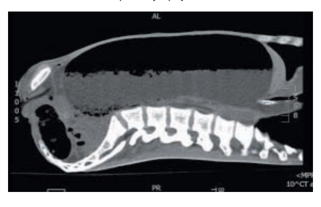
Figure 3. Sagital CT view shows the distended stomach almost reaching pubic symphysis.