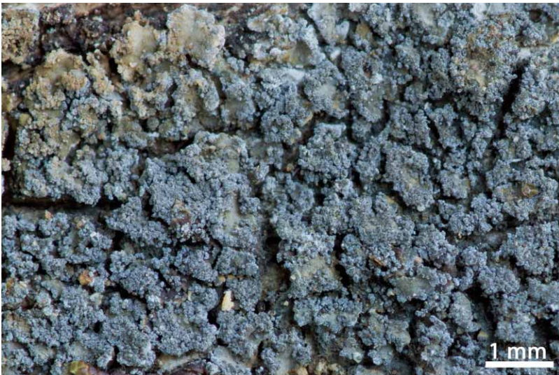
Fig. 4. Fuscopannaria mediterranea (Mayrhofer 18438), a species rare in Montenegro.

roadside Morus alba . The list presented is based on collections made by the first author in 2004 and supplemented with studies by the first and second author in 2009. The specimens have been identified with the aid of POELT (1969), POELT and VĚZDA (1977, 1981), CLAUZADE and ROUX (1985) and WIRTH (1995). Some of the identifications required verification using standardized thin-layer chromatography (TLC) following the protocols of