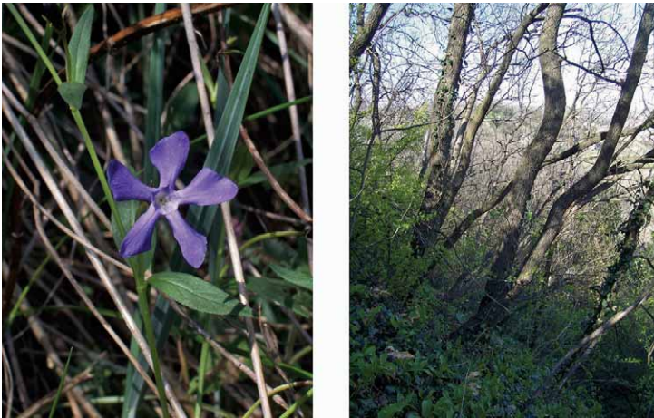
Fig. 2. and 3. Flowering Vinca herbacea and its habitat on Bansko Hill, near Zmajevac