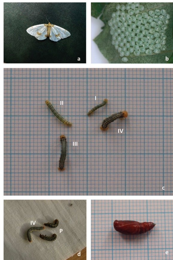
Figure 1. Different development stages of spotted ash looper ( Abraxas pantaria ) a) butterfly b) egg mass c) 1 st –4 th larval stage d) 4 th larval stage and prepupa (P) e) pupa.

The results of this experiment show that the egg stage lasts 4–6 days, the caterpillar eclosion ends after 3 days (18 to 20/08/2012.). Caterpillars do not eat the egg shell. First moulting (from 1 st to 2 nd larval instar) followed after 2 days, and 1 st larval instar lasted on average 6–9 days (Table 1). The 2 nd instar lasted 7–12 days (Table 1). Larvae of the first two instars eat lower epidermis and parenchyma tissue making furrows and small holes. They do