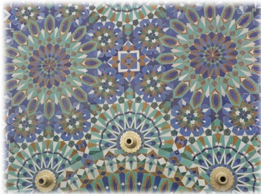
Bogatstvo kolorita u Casablanci / The richness of colors in Casablanca