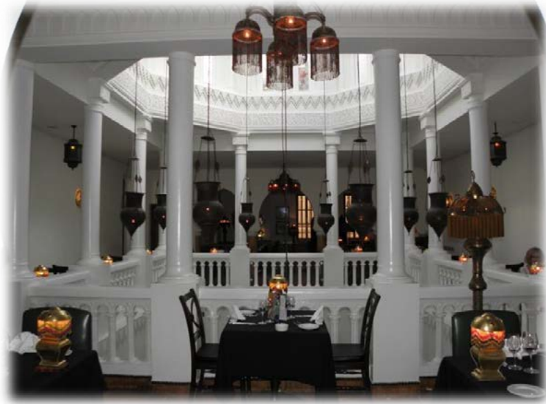
Francuski utjecaj na ugostiteljsku ponudu „Rick’s Cafe Casablanca”/ French influence in the restaurant business " Rick's Cafe Casablanca "