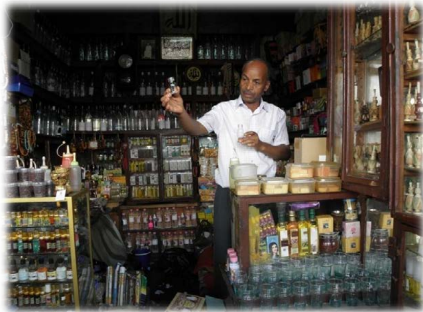
Specijalna tradicionalna proizvodnja i prodaja maslinovih ulja / Special traditional manufacturing and selling of olive oil