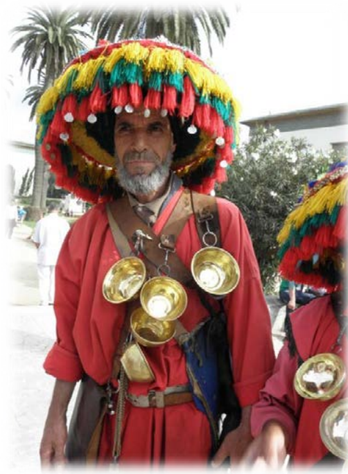
Vodonošci na trgovima Casablance / Water carriers on the streets of Casablanca