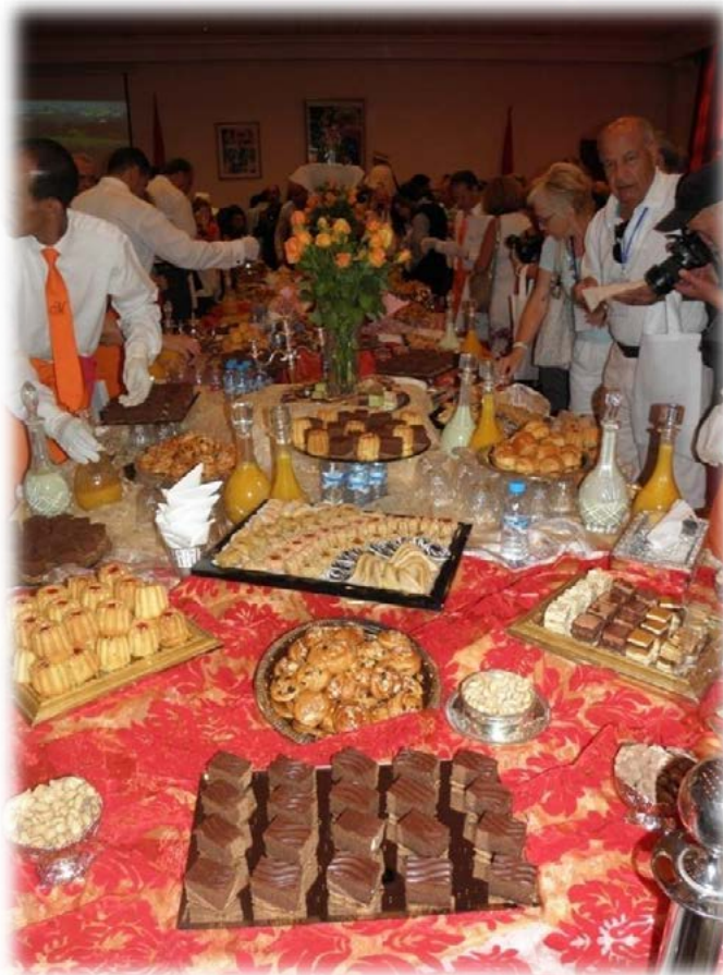
Dobrodošlica za sudionike FIJET-Congresa u Upravi regije Marrakeech (11.09.2013) / Welcoming the participants of FIJET Congres in Management of Marrakeech region (11/09/2013)