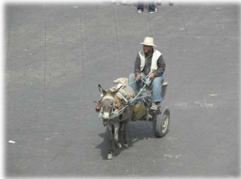
Živopisna slika Marrakecha / Vivid images of Marrakech