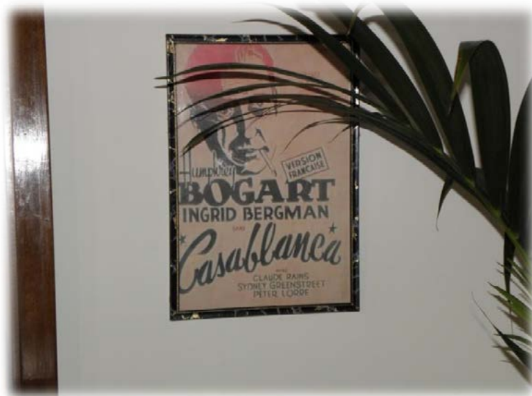
Legendarni film „Casablanca“ kao prepoznatljivi turistički brend Casablance / The legendary film "Casablanca" as a distinctive tourism brand of Casablanca