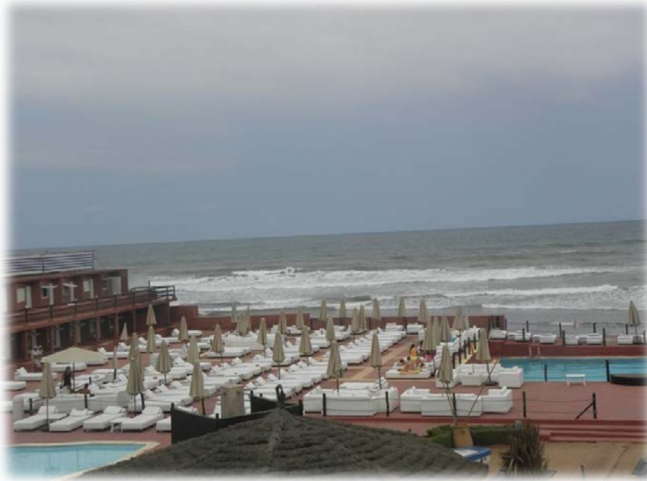
Francuski utjecaj na hotelsku industriju Casablance / French influence on the hotel industry of Casablanca