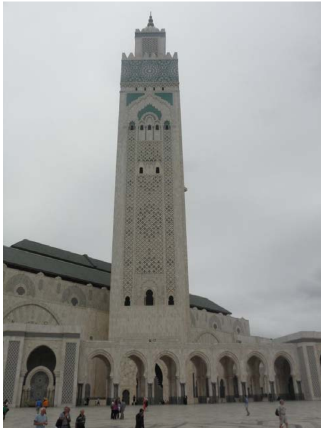
Velebna zgrada najveće džamije koja može istovremeno primiti 100.000 vjernika na obali Casablance / The magnificent building of the largest mosque, which can accommodate 100,000 pilgrims on the coast of Casablanca