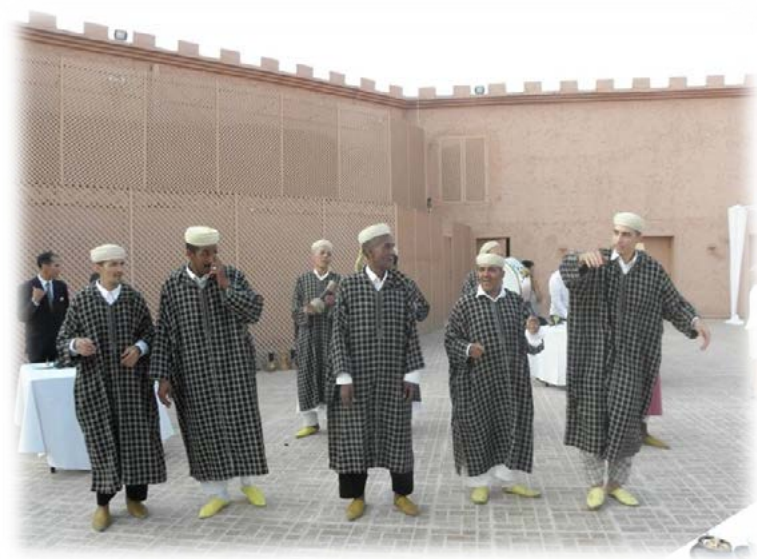
Ritualni tradicionalni plesni svečani doček gostiju / Traditional dance ritual for ceremonial welcoming the guests