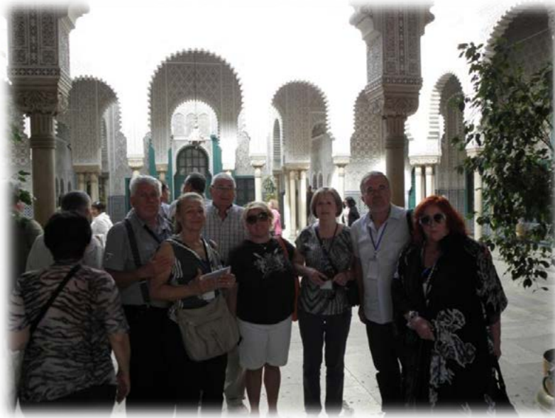
Sudionici kongresa "FIJET – CROATIA" u razgledavanju znamenitosti Casablance / Congress participants "FIJET - CROATIA" sightseeing in Casablanca