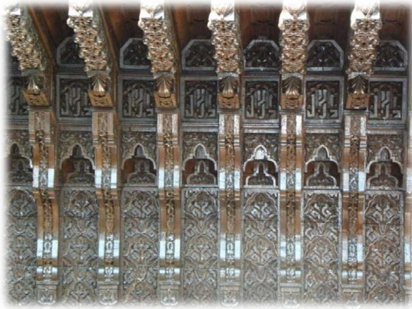
Ukrasni drvorez i stoljetna kultura u Casablanci / Decorative woodcut and secular culture in Casablanca