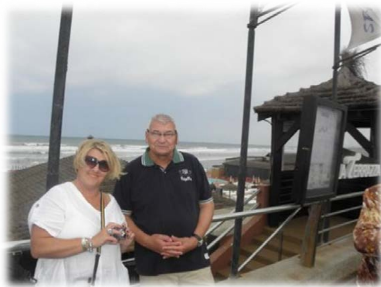
Sudionici "FIJET Congressa" u obilasku atraktivne plaže na obali Atlantskog oceana u Casablanci / Participants of FIJET Congress visiting the attractive beaches on the Atlantic coast in Casablanca