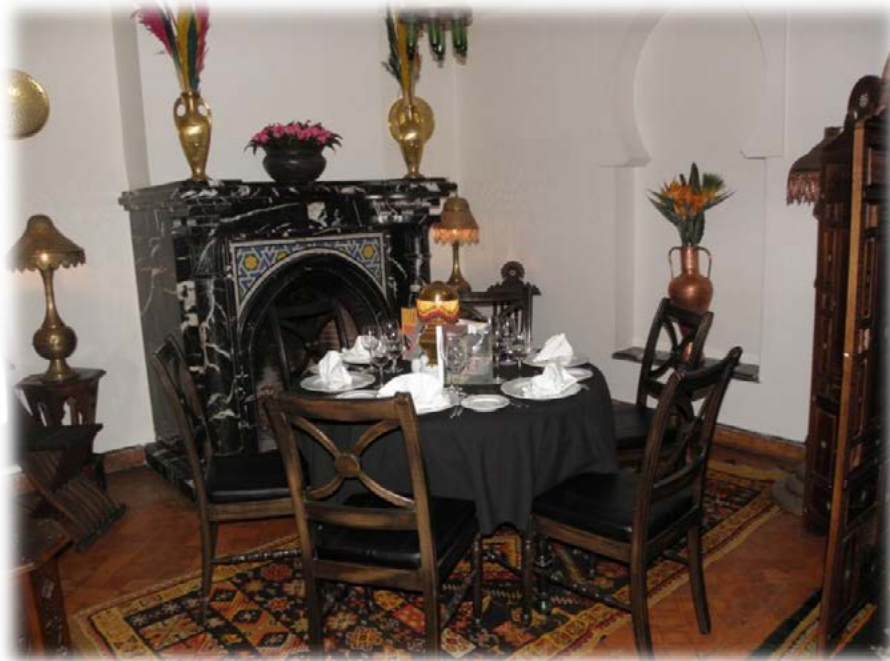
Odlazak u kultni “Rick’s Cafe Casablanca” je nezaobilazna postaja novinara, komunikologa i turista koji dolaze u Casablancu / Checking iconic "Rick's Cafe Casablanca" is a must stop for journalists, communication experts and tourists who come to Casablanca