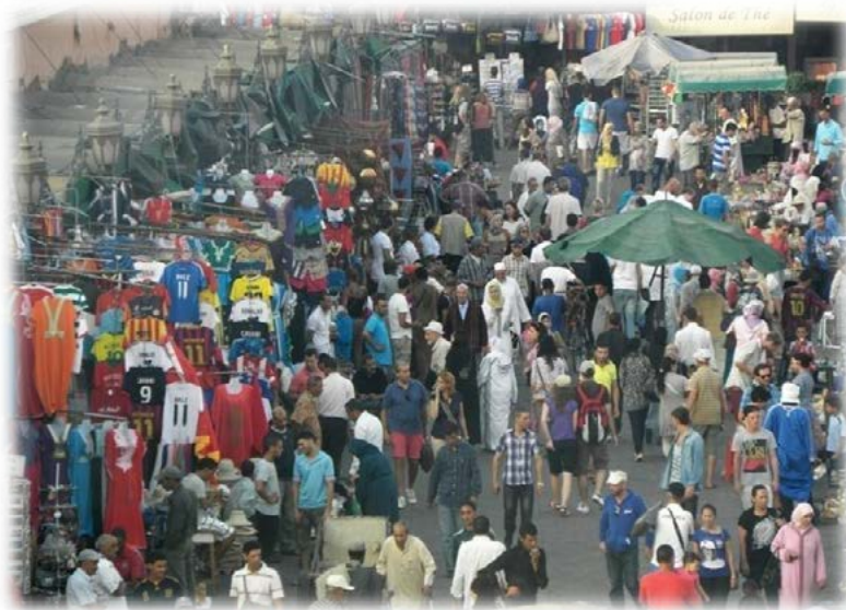
Živopisna turistička slika ulica stare „Medine“ u Marrakechu / Picturesque tourist image of old street "Medina" in Marrakech