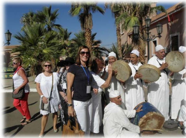
Tradicionalni folklor i veseli doček sudionika FIJET- Congressa u Regiji Marrakech (11.09.2013) / Traditional folklore and looking forward to welcoming participants FIJET Congress in Marrakech Region (11/09/2013)