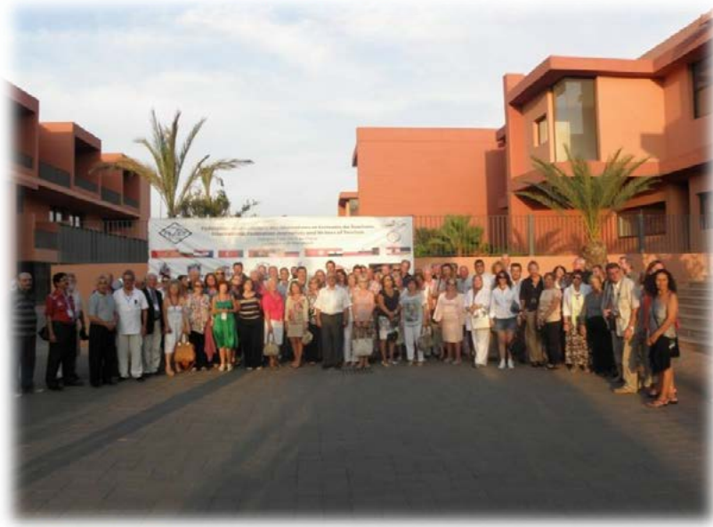
FIJET Congres je radno i tematski nastavio rad u gradu Marrakechu / FIJET Congress continued to work in the city of Marrakech