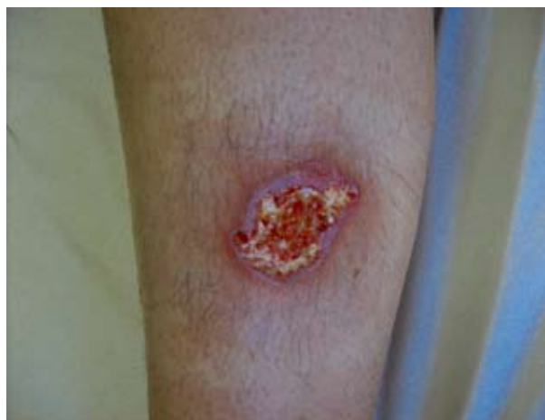
Fig. 3. Wound improvement after occlusive bandaging.

Repeat swab culture from the lesion was also sterile. Duplex ultrasonography of pelvic and lower limb arteries and veins showed no signs of vascular illness or trauma. Erythrocyte sedimentation rate and C-reactive protein were within the reference range. The levels of IgE and anti-streptolysin O titers were increased. In addition, chest x-ray, spirometry, x-ray of the left lower limb and abdominal ultrasound were performed, showing no abnormalities. This outcome of clinical tests raised our suspicion of a factitious