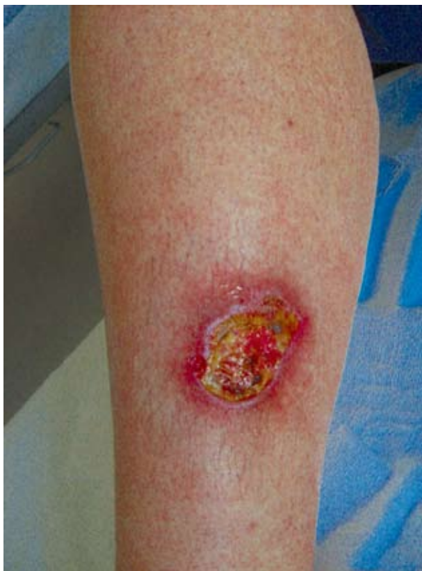
Fig. 1. Shallow ulcer on the lateral side of the patient's left lower leg.

site of the lesion and otherwise could not explain the lesion. She was hospitalized 10 months before for hypertension, hyperlipoproteinemia, hyperuricemia, and abnormal serum glucose levels. Metabolic syndrome was diagnosed in the patient 10 months before and the patient was on antihypertensive therapy. Diagnostic procedures included a swab taken from the lesion, which was sterile and a skin biopsy performed on the lesion with a nonspecific histopathologic finding of a crust. She was treated with systemic oral antibiotics and topical ointments. The patient's follow up was assigned in 7 days but the patient came a month later with an enlarged skin lesion, measuring 5x3.5 cm, with a yellowish-brown non-secernating sediment, clinically still appearing as a typical pyoderma gangrenosum (Fig. 1).