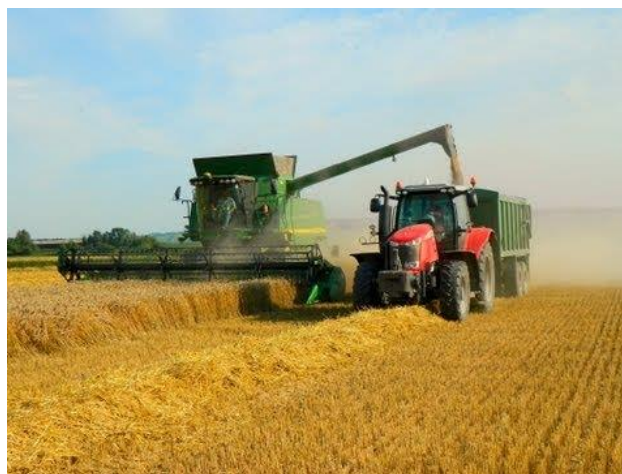
Fig. 1: JohnDeere CTS 9780

JohnDeere CTS 9780 (Fig. 1) has been developed for a high quality processing of various types of crops, even in worse conditions, as for example wet straw, excessive returns, etc. A key is a threshing drum (Fig. 2), the diameter of which is 660 mm and a twin-separation CTS Cylinder Tine – Separation. To process larger amounts of vegetable mass in less time, a Headertrak system is used, which allows automatic terrain copying by the cutting table.