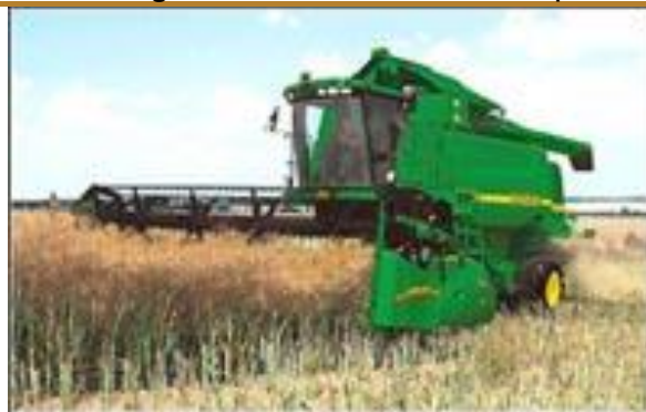
Fig. 3: John Deere Z2264

JohnDeere Z2264 grain harvester (Fig. 3), also called a “Z” series, is no longer in production. We can say that the series mentioned above has done well in Slovakia. This is a relatively standard and simple harvester with one threshing drum and shakers’ flat of 6.4 m 2 . The operator has sufficient comfort and ease of use even when the equipment diagnosis is lower class and less user friendly than the CTS.